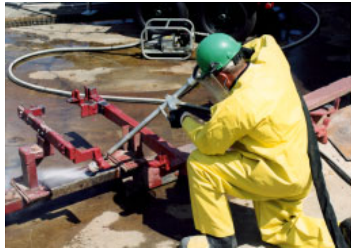
Paint removal for automotive skids using the NLB Model NCG8400A-3 rotating hand lance.