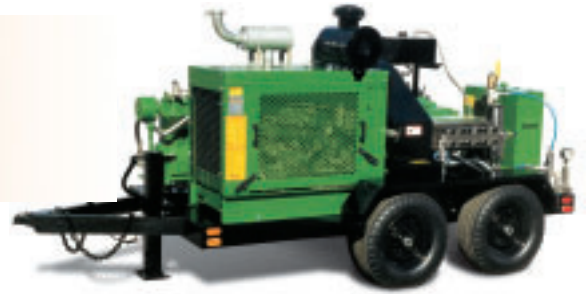
Model 40201D - 6 gpm (23 lpm) at 40,000 psi (2,500 bar)