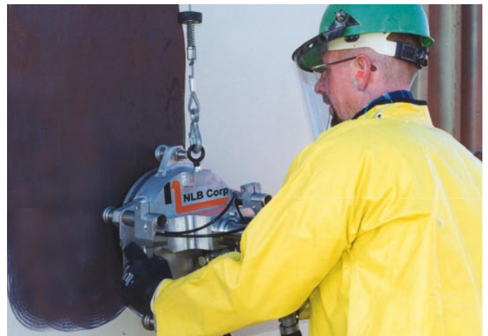
NLB's HydroPrep™ line of surface preparation tools reduce environmental impact and eliminate the need for containment.

Specifications subject to change without notice.